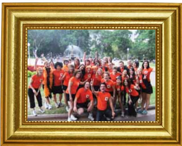
Pictured (top) : Volunteers supporting the Great Australia Swim Series on Australia Day.