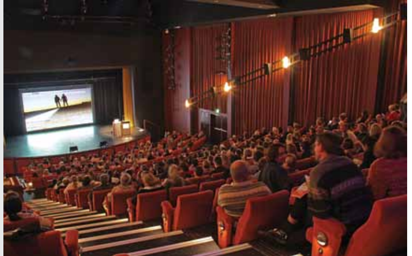
Pictured: Participants attending the Navigating Teenage Depression Seminar

The workshop includes several activities designed to help participants enhance their own personal resilience in the face of life's challenges.